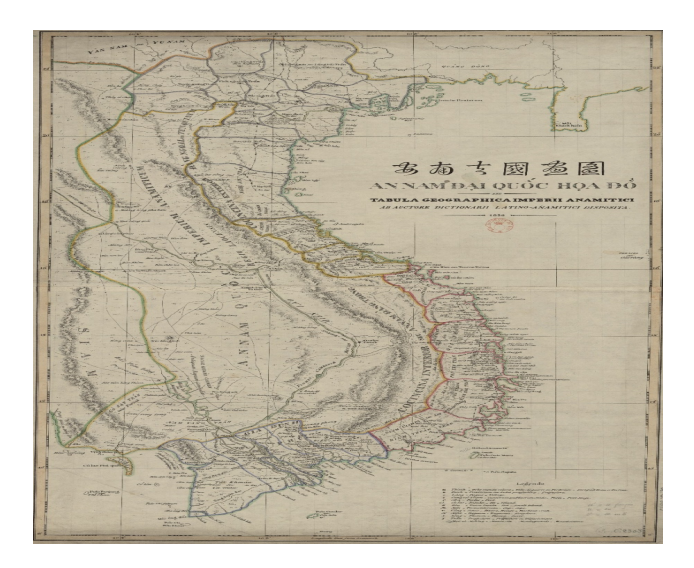
Overview of Annam Dai Quoc Map showing Hoang Sa archipelago under the name "PARACEL seu Golden Sand",

Below is the full map and excerpt showing the location of the Paracel Islands named "PARACEL seu Cat Vang":