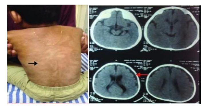
Figure 3. Patches of Hypomelanosis of Into with CT-Scan

Hypomelanosis of Ito affected two children out of ten; they experienced 50% generalized tonic-clonic seizures, and developmental delays were reported in both of them. Both individuals had distinct cell lines at the back of their bodies due to post-zygotic mutations; these genetic changes affected their skin pigmentation, as shown in Figure 3 and its CT-Scan presented in Figure 4.